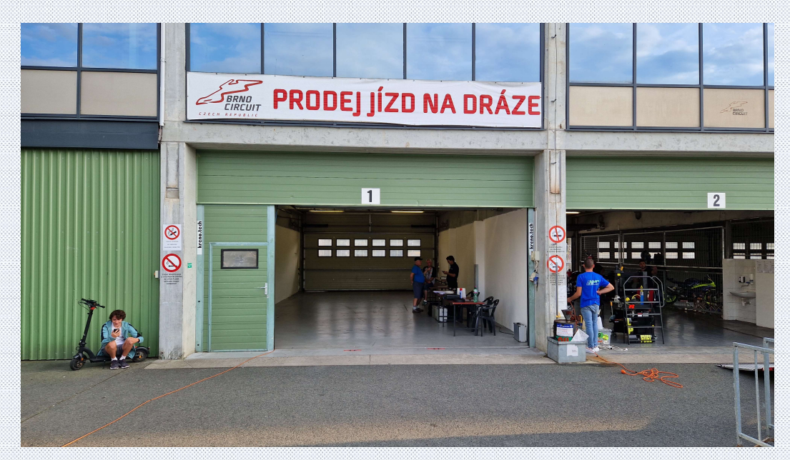
Behind Box 1